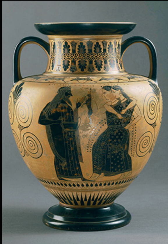
Amasis Painter DIONYSOS WITH MAENADS c. 540 BCE. Black-figure decoration on an amphora. Ceramic, height of amphora 13" (33.3 cm). Bibliothèque Nationale, Paris, France. Bibliothèque nationale de France [Fig. 05-25]