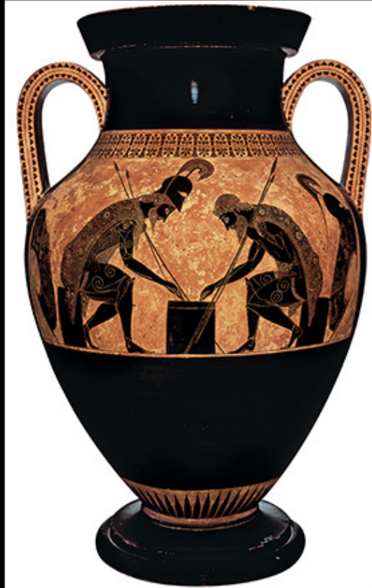
Exekias (potter and painter) AJAX AND ACHILLES PLAYING A GAME c. 540-530 BCE. Black-figure painting on a ceramic amphora, height of amphora 24" (61 cm). Musei Vaticani, Rome. [Fig. 05-01]